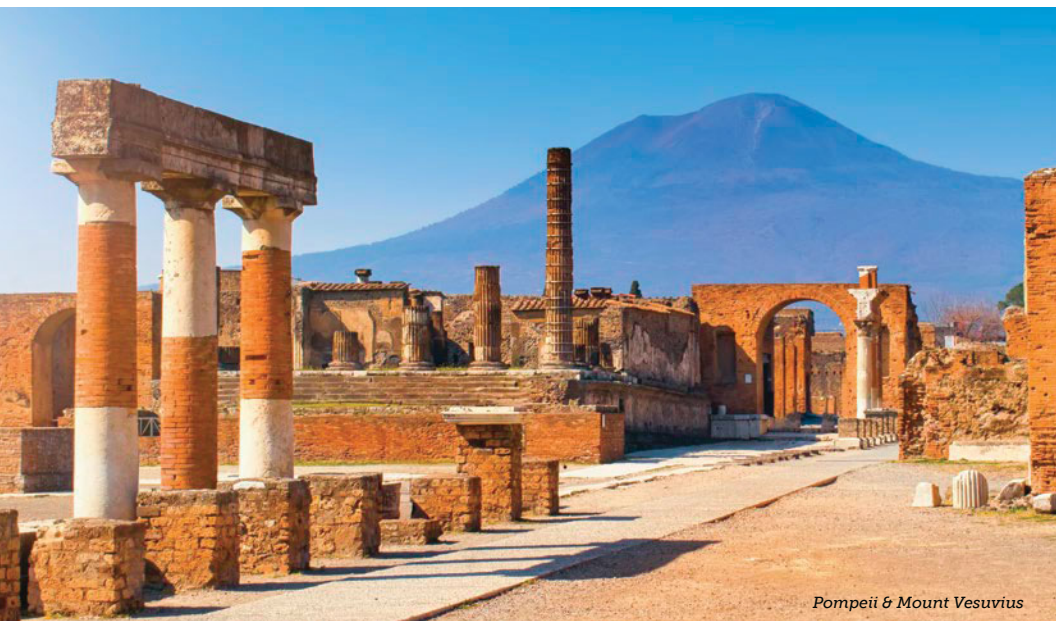
Pompeii & Mount Vesuvius

Archeologico Nazionale. The museum's galleries boast one of the largest collections of Greco-Roman artifacts in the world. Continue on a panoramic tour of Naples, taking in sprawling views of the city and the Bay of Naples from atop Posillipo Hill. Note the landmarks of Castel Nuovo, San Francesco di Paola, Teatro di San Carlo and Piazza del Plebiscito.