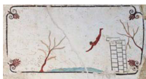
Fresco, Tomb of the Diver, Paestum