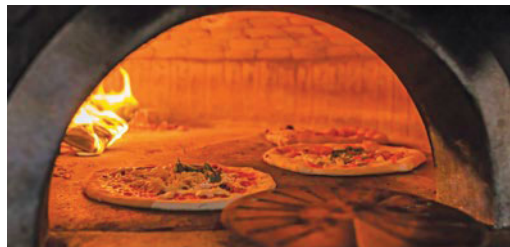
Above: Neapolitan pizza | Below: Olive oil & cheese