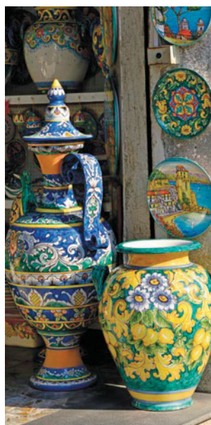
Pottery, Vietri sul Mare

Knowledgeable Lecturers deepen your appreciation for the region and its history, culture and current events.