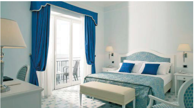
Vietri sul Mare