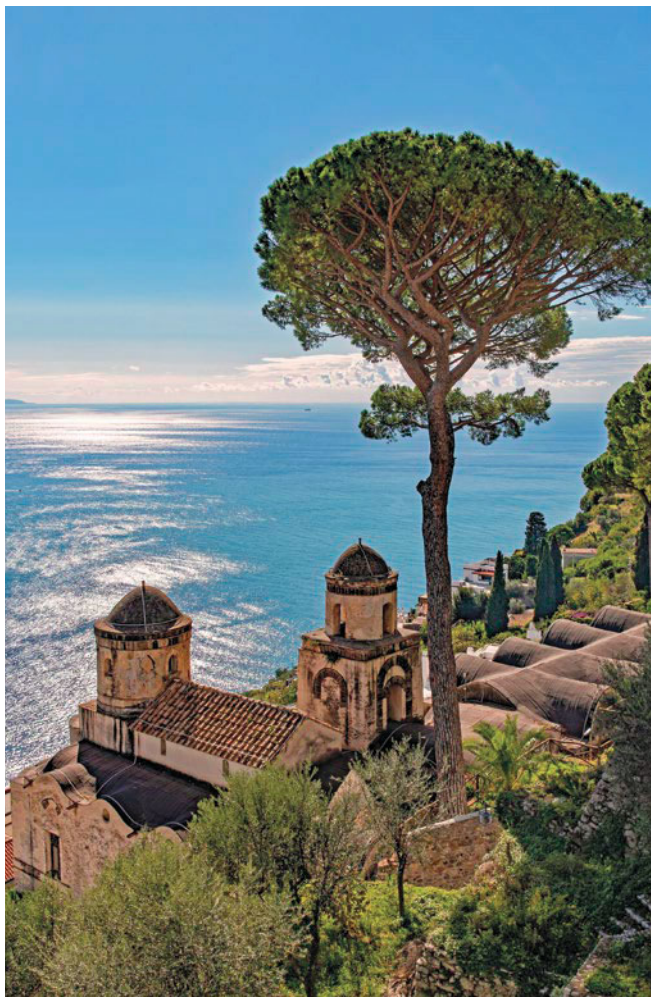
Villa Rufolo, Ravello