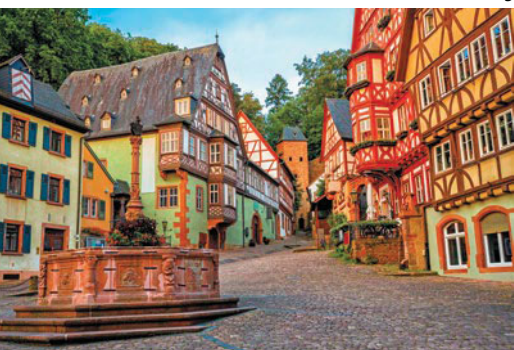
Half-timbered homes, Miltenberg