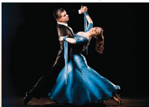
Waltz performance, Vienna