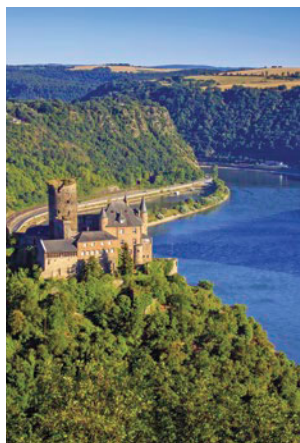
Upper Middle Rhine Valley