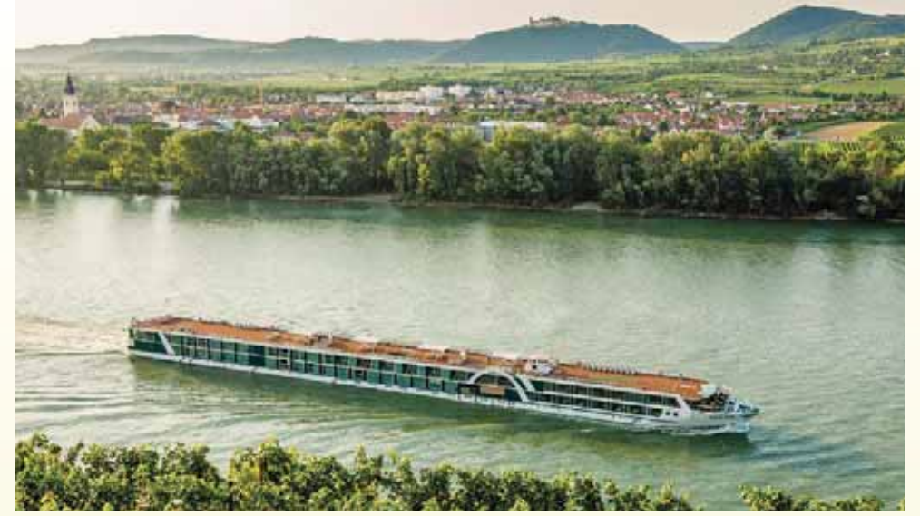
MS Amadeus Queen