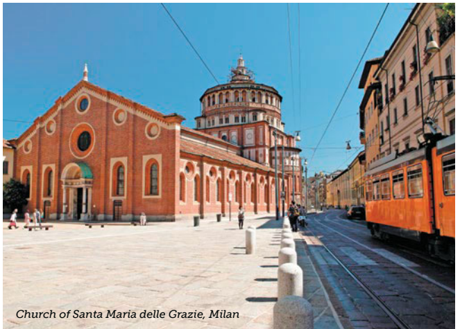
Church of Santa Maria delle Grazie, Milan