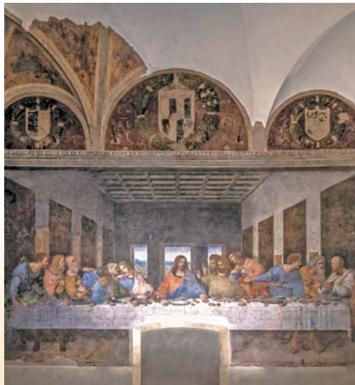
Leonardo da Vinci's "The Last Supper"