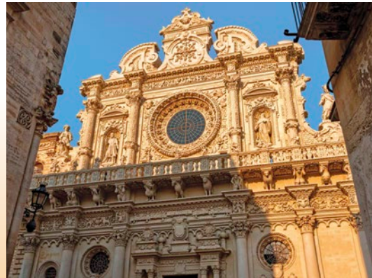
Basilica di Santa Croce, Lecce

Enrichment: History & Architecture of Lecce & Ostuni. Learn about this region's fascinating history and unique architectural styles.