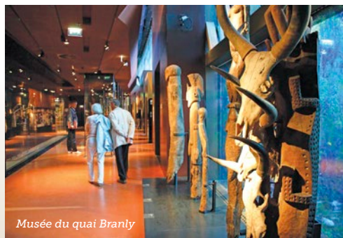
Musée du quai Branly

Free Time: After a group lunch, indulge in fine