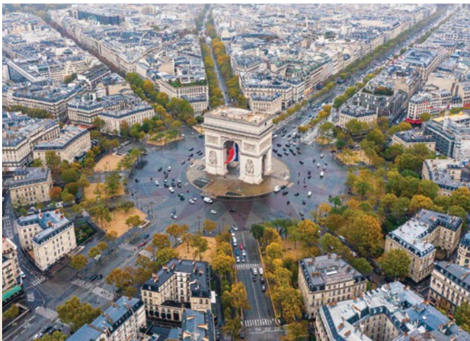
Arc de Triomphe and the Champs-Élysées

After World War I, Parisians rebuilt their lives as jazz, a new sound introduced to France by African American soldiers, filled the air. Lively and unique, jazz was the perfect soundtrack to a fresh start, both for French music fans and African American troops. The 369th Infantry Regiment is credited with transforming Paris' cultural scene. The unit became famous for its bravery and its band, led by Lieutenant James Reese Europe and Sergeant Noble Sissle. Attached to the French army because U.S. forces were still segregated, the 369th Infantry was brave in battle. Nicknamed the "Harlem Hellfighters" by the Germans, the 369th and several individual soldiers were singled out for France's highest award for valor. Off the battlefield, the band boosted morale across France with music that would soon fill Parisian clubs. For two decades, Montmartre hosted the flourishing jazz community, which drew African American musicians and club owners from the U.S. Several musicians left Paris during Germany's World War II occupation, but the city's love of jazz never wavered. Jazz surged again after the war with great African American musicians leading the way, and the music still delights concertgoers today.