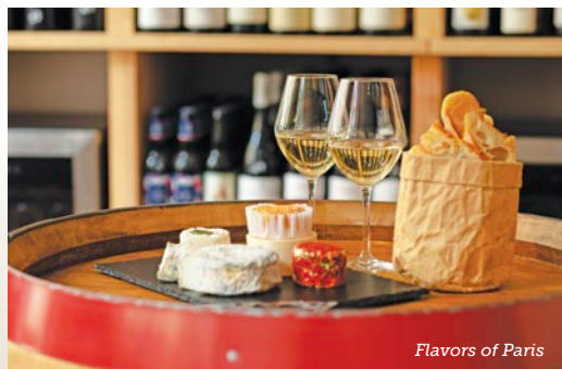
Flavors of Paris

Free Time: Take advantage of free time to discover Paris on your own!