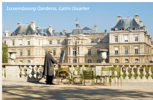
Luxembourg Gardens, Latin Quarter