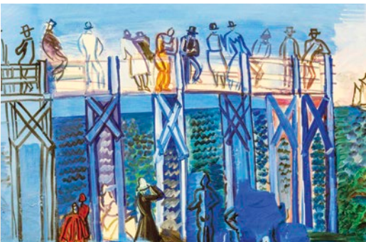
The Pier and the Beach at Le Havre, Raoul Dufy (1926) MuMa, Le Havre