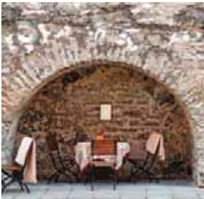
Old Town, Tallinn

Historic Center (Old Town) of Tallinn, Estonia