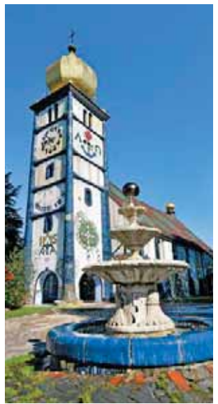
St. Barbara Church, Bärnbach