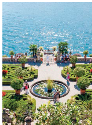
Isola Bella, Lake Maggiore