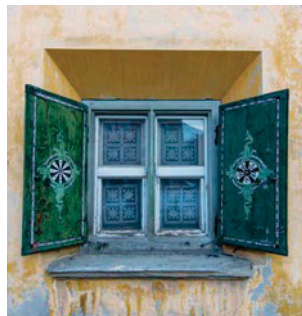
Charming Engadine architecture