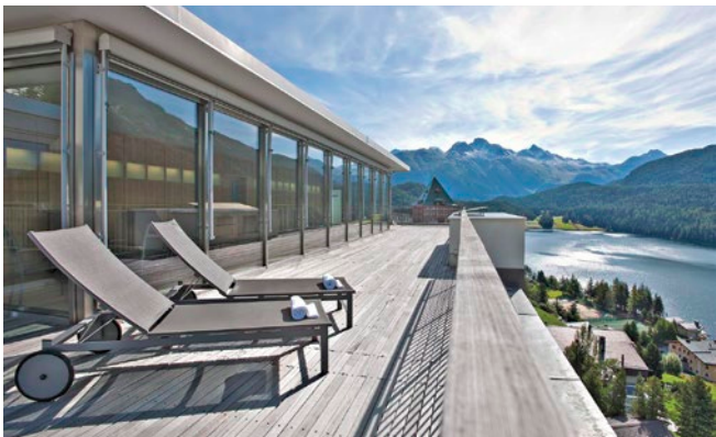
Hotel Schweizerhof | St. Moritz