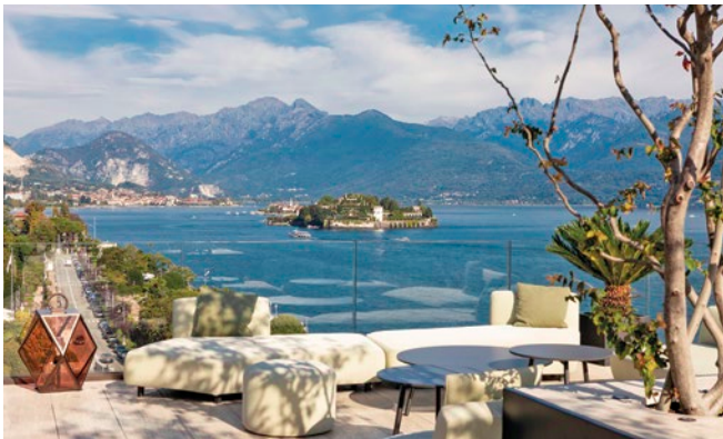
Hotel la Palma | Stresa