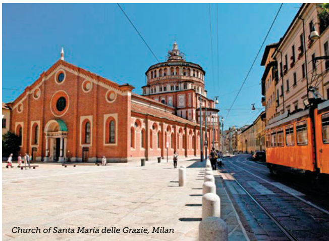
Church of Santa Maria delle Grazie, Milan