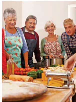
Piedmontese cooking class