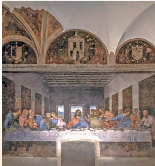
Leonardo da Vinci's "The Last Supper"