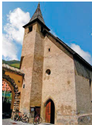
Old church, Zuoz