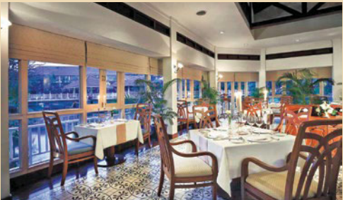
Sofitel Angkor Phokeethra Golf and Spa Resort | Siem Reap