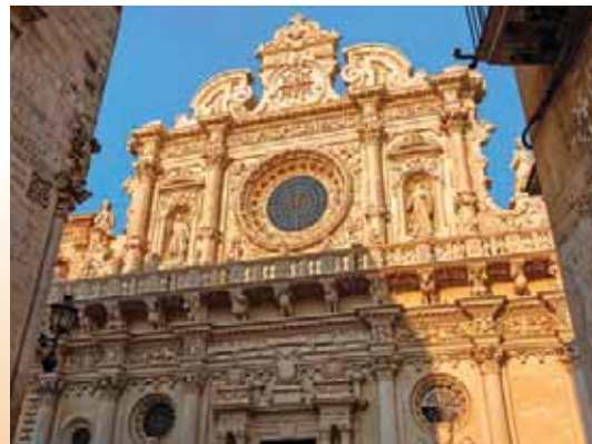
Basilica di Santa Croce, Lecce

Enrichment: History & Architecture of Lecce & Ostuni. Learn about this region's fascinating history and unique architectural styles.