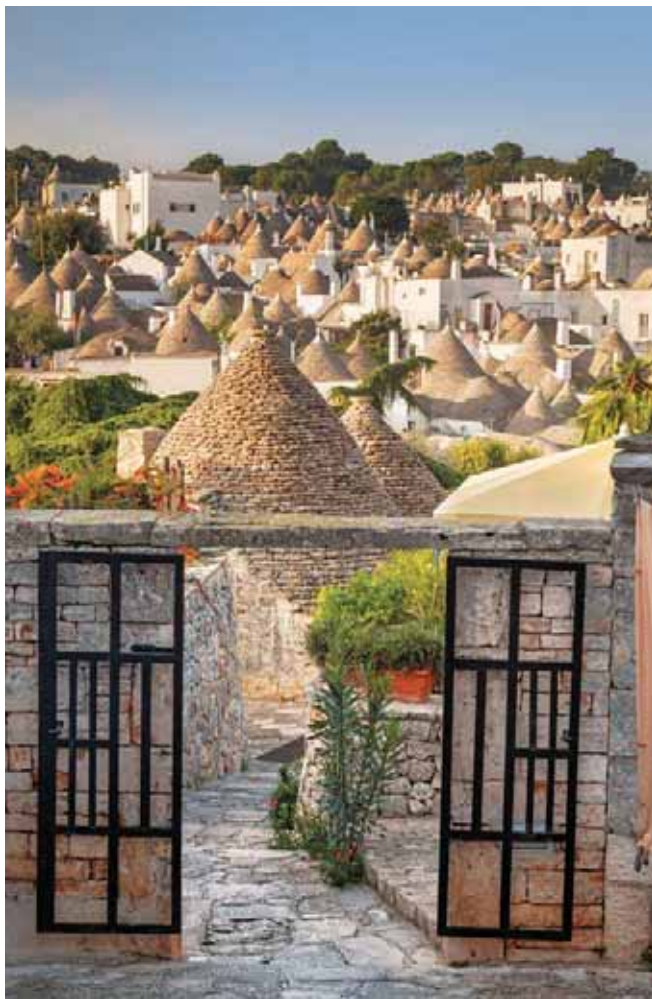
Trulli of Alberobello