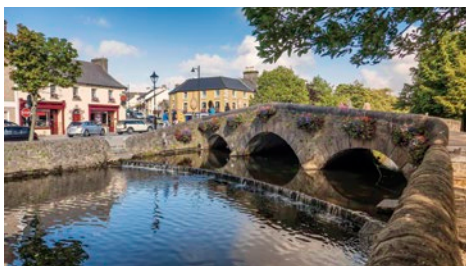
Above: Kylemore Abbey | Below: Westport