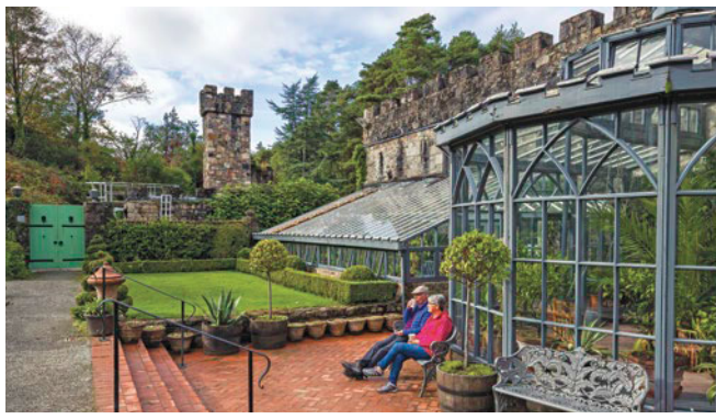
Glenveagh Castle, Glenveagh National Park