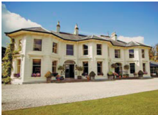
Rathmullan House | Rathmullan