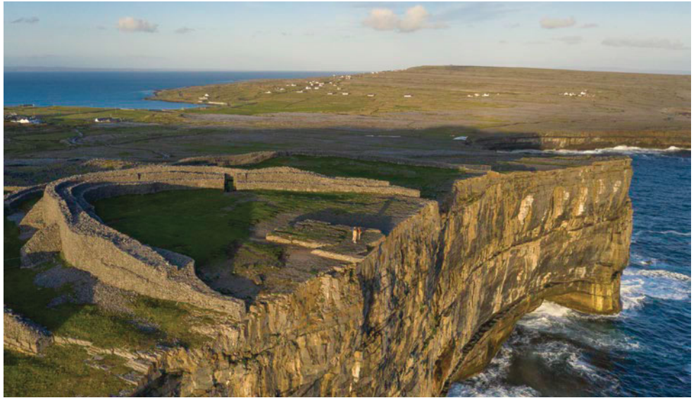
Dun Aengus, Inishmore