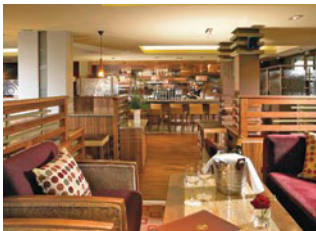
Westport Plaza Hotel | Westport