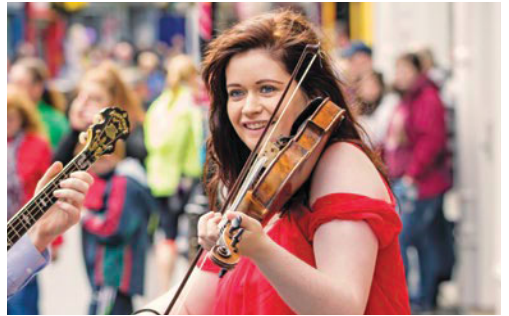
Top: Kylemore Abbey | Above: Musician

Aran Island of Inishmore. Ferry across Galway Bay to the largest of the Aran Islands. As you travel on a minibus, your local guide will share entertaining stories about life on this stark, arresting island, where Gaelic is the first language. See cliffside Dun Aengus, the most famous of the Aran Islands' Bronze Age forts, and pause for lunch before your return ferry.