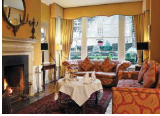
Old Ground Hotel | Ennis