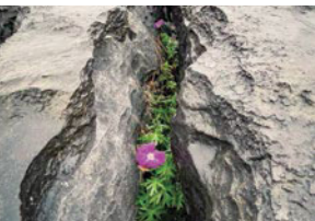
Flora among the limestone, Burren