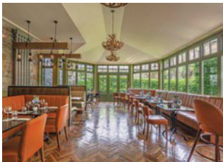
The Lodge at Castle Leslie Estate | Glaslough