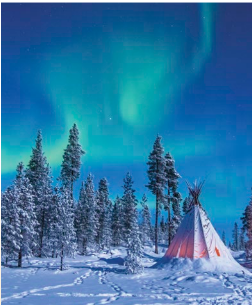
Warming hut at Aurora Camp