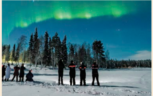
Northern Lights Village | Pyhä