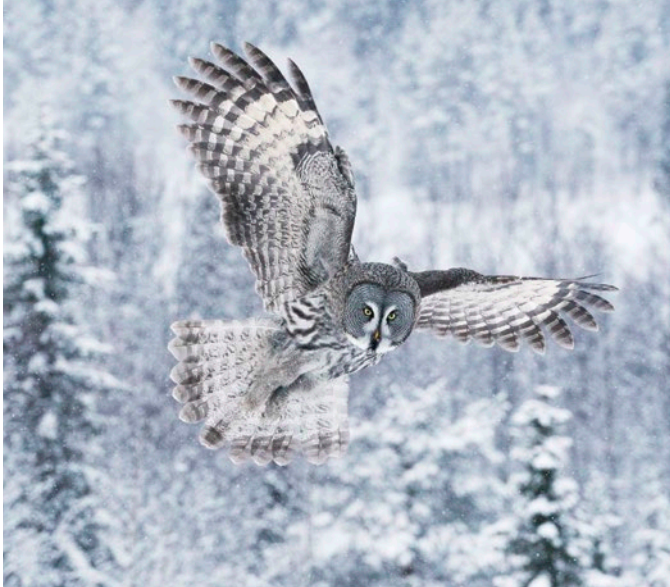
Great Grey Owl, Lapland