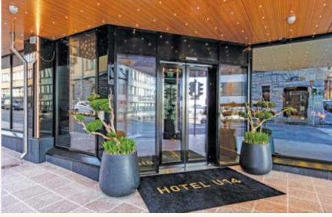
Hotel U14 | Helsinki