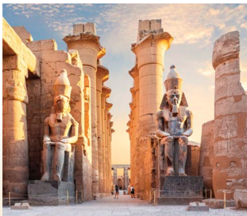
Temple of Luxor