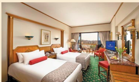
Sonesta St. George Hotel Luxor | Luxor (Rooms renovated in 2025 | Updated images coming soon)