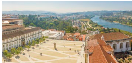
University of Coimbra