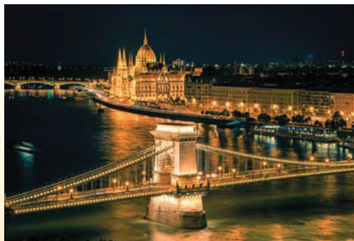
Budapest at night