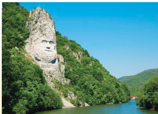
Decebalus stone sculpture, Iron Gate Gorge

Picturesque Passau. See Niedernburg Abbey, the medieval Veste Oberhaus, St. Stephen's Cathedral and other celebrated sites.