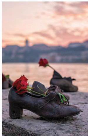
Shoes on the Danube Bank, Budapest