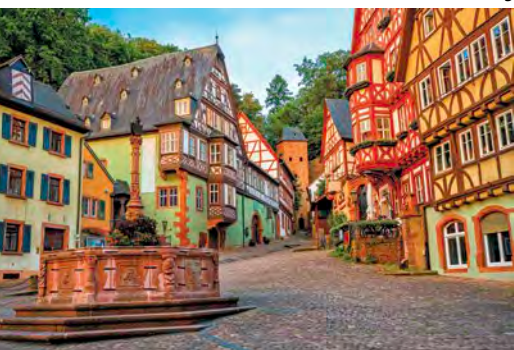
Half-timbered homes, Miltenberg