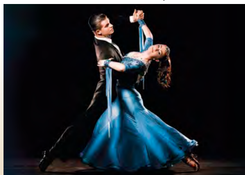
Waltz performance, Vienna