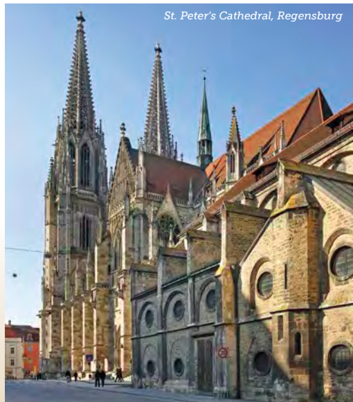
St. Peter's Cathedral, Regensburg