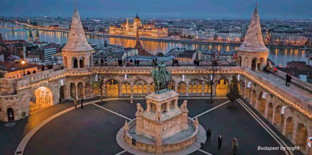
Budapest by night