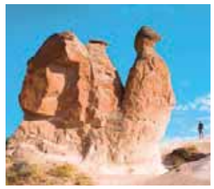
Devrent Valley, Cappadocia