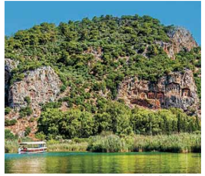
Lycian Tombs of Kaunos