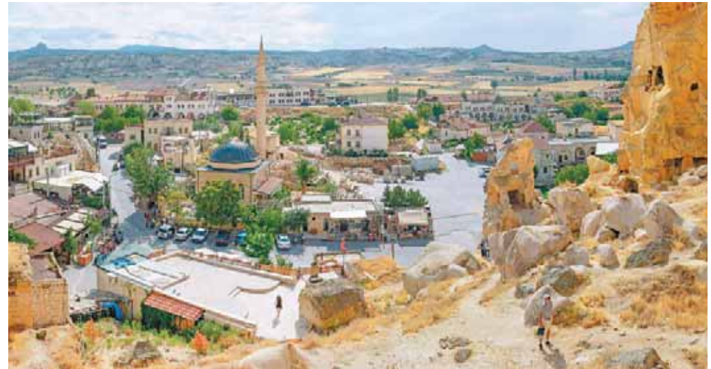
0. . . . . . . . . . . .