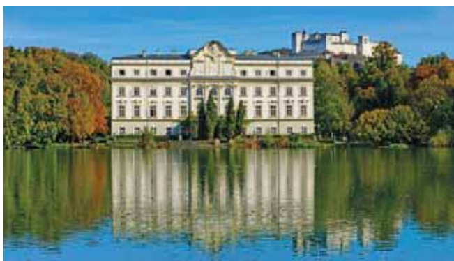
Leopoldskron Palace, one of the filming locations of "The Sound of Music"