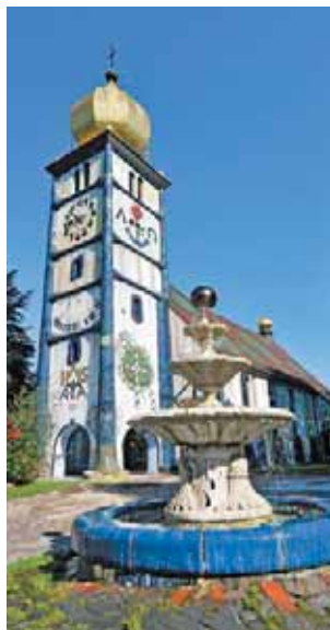
St. Barbara Church, Bärnbach