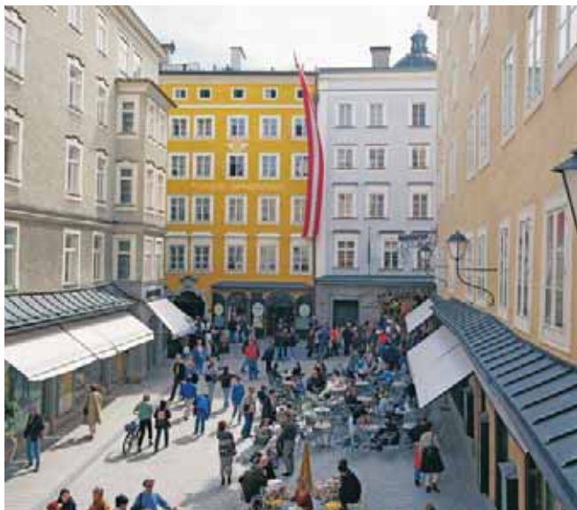
Mozart's Birthplace, Salzburg