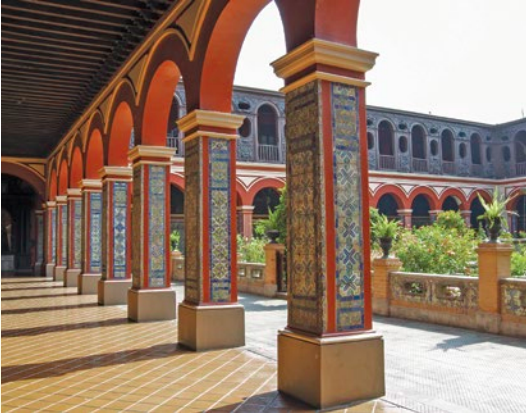
Monastery of Santo Domingo

Ollantaytambo. Explore this Inca hillside fortress renowned for its huge terraces. Next, embark on a scenic train ride through the Sacred Valley to the town of Aguas Calientes and the Inkatererra Machu Picchu Pueblo hotel. Machu Picchu. Nestled in a cloud forest high in the Andes, the Lost City of the Incas is