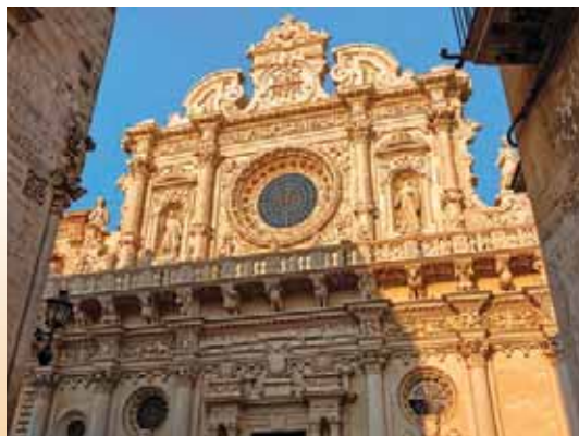
Basilica di Santa Croce, Lecce

Enrichment: History & Architecture of Lecce & Ostuni. Learn about this region's fascinating history and unique architectural styles.