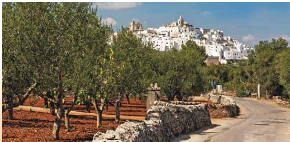
Ostuni, "The White City"

Visit a family-run olive mill in the sun-baked countryside. Learn about the history and cultivation process of olives. Unwind over lunch and gather with the mill's employees or owners to discuss life in Italy.