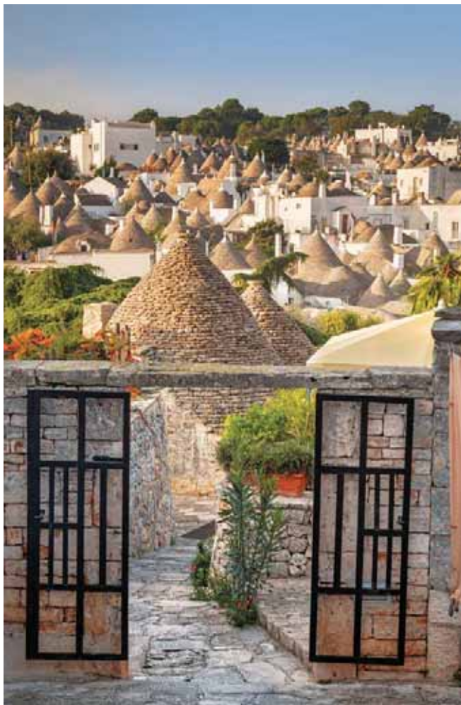
Trulli of Alberobello