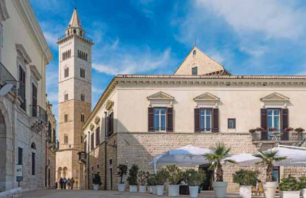
Cathedral bell tower, Trani