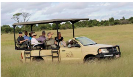
Top: Lion | Above: Safari