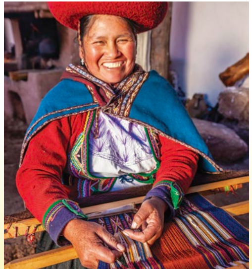
Traditional Peruvian weaving