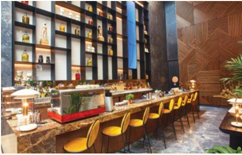
Pullman Lima Miraflores | Lima