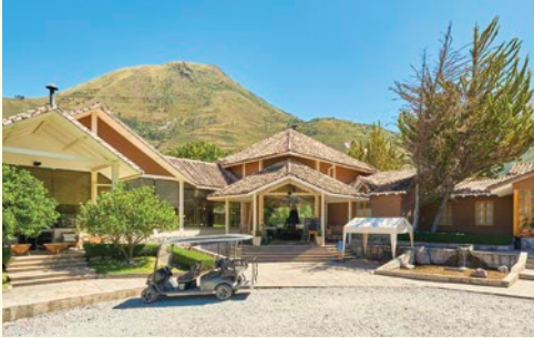
Casa Andina Premium Valle Sagrado | Sacred Valley