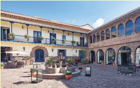
Palacio del Inka | Cusco