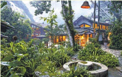
Inkaterra Machu Picchu Pueblo | Machu Picchu