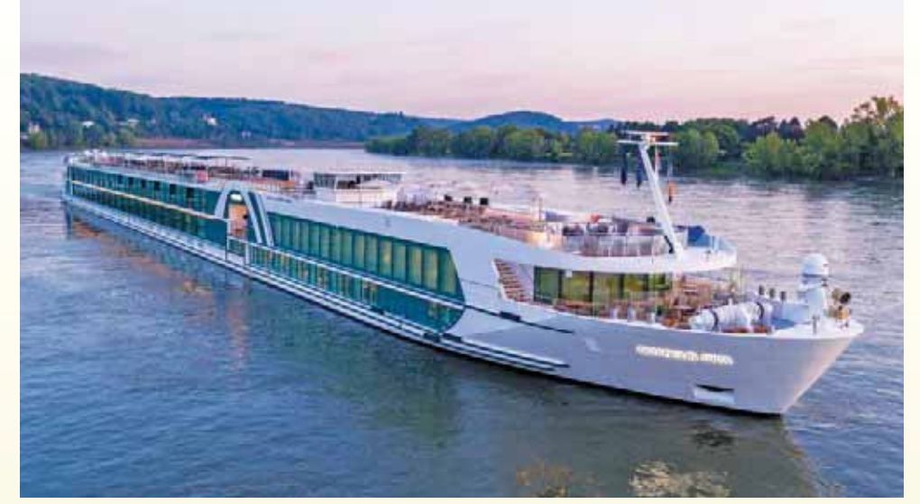
MS Amadeus Riva