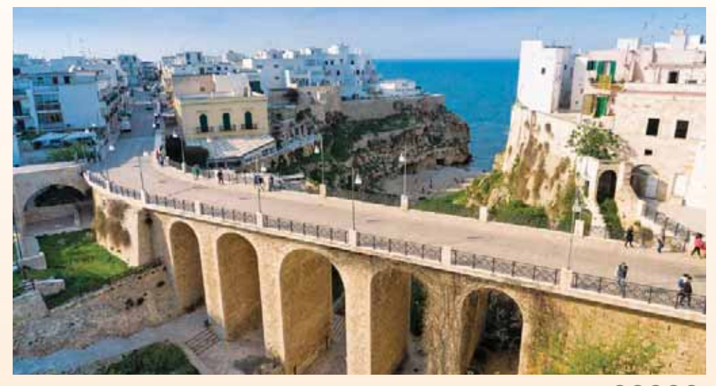
Hotel Covo dei Saraceni | Polignano a Mare