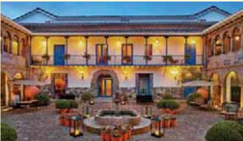
Palacio del Inka | Cusco