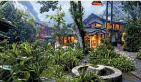
Inkaterra Machu Picchu Pueblo | Machu Picchu