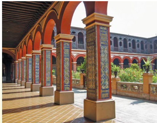
Monastery of Santo Domingo

Machu Picchu. Nestled in a cloud forest high in the Andes, the Lost City of the Incas is