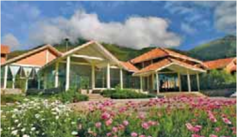
Casa Andina Premium Valle Sagrado | Sacred Valley