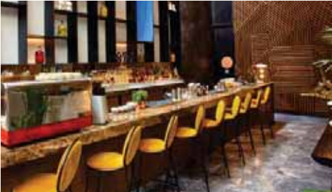
Pullman Lima Miraflores | Lima