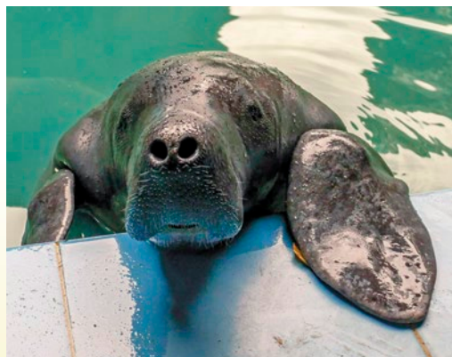
Manatee Rescue Center