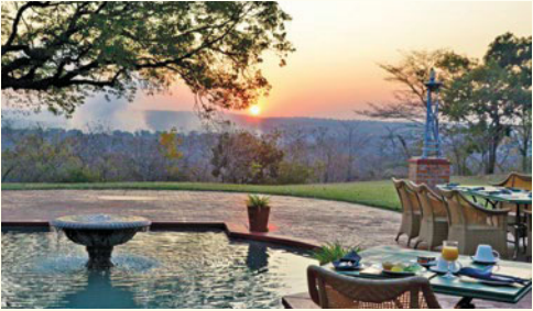
The Victoria Falls Hotel | Victoria Falls