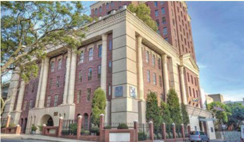
54 on Bath | Johannesburg