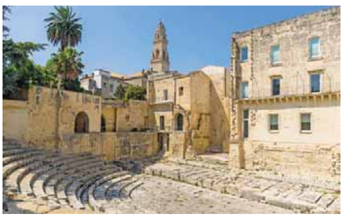
Ruins of a Roman amphitheater, Lecce