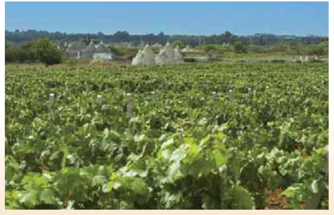
Vineyards and trulli in the countryside near Alberobello