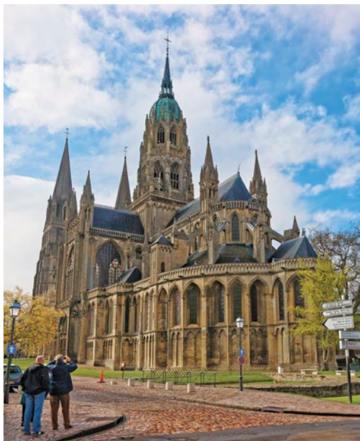
Notre Dame Cathedral, Bayeux