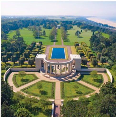
Normandy American Cemetery

D-Day and the Battle of Normandy. Begin in Arromanches, where you'll see the site of an offshore mulberry harbor and visit the museum there. These floating harbors enabled the Allies to funnel enormous resources into France to wage war against Hitler. Afterward, walk along Omaha Beach, see the memorial and reflect upon the exceptional courage of the Allied landing forces, who valiantly advanced under devastating fire across the heavily fortified