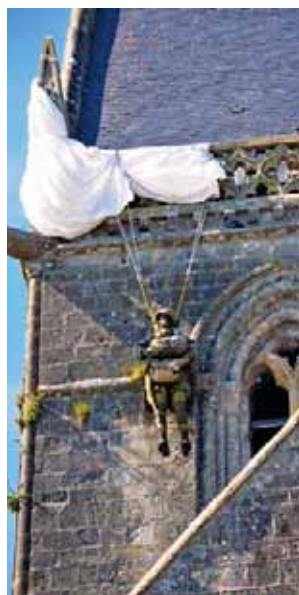
Private John Steele Monument, Sainte-Mère-Église

Knowledgeable Lecturers deepen your appreciation for the region and its history, culture and current events.