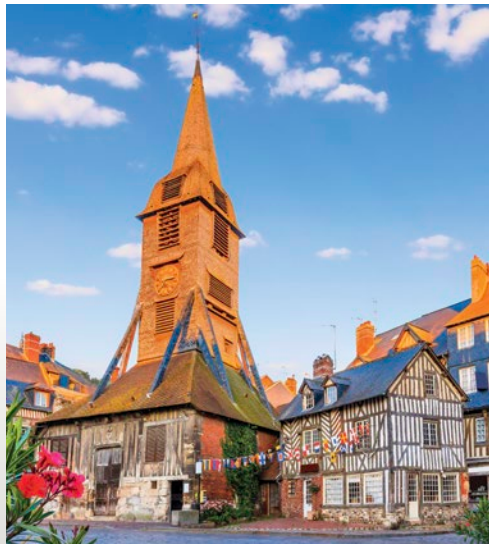
Church of Sainte Catherine, Honfleur

Free Time: Select a special place for dinner. Your Travel Director can assist with planning.