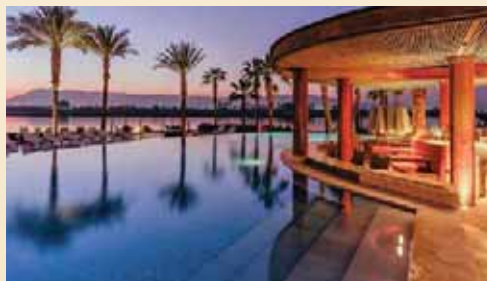
Hilton Luxor Resort & Spa | Luxor