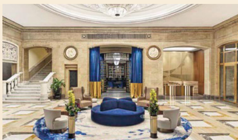
Sofia Hotel Balkan | Sofia