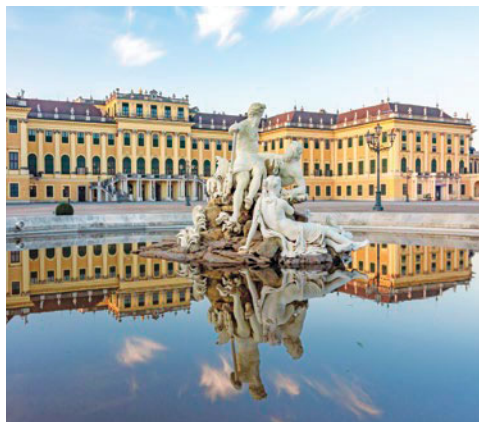
Front facade of Schönbrunn Palace