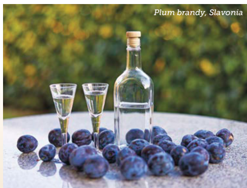
Plum brandy, Slavonia

• Science & Scientist Tour. Browse exhibits and films at the Nikola Tesla Museum.