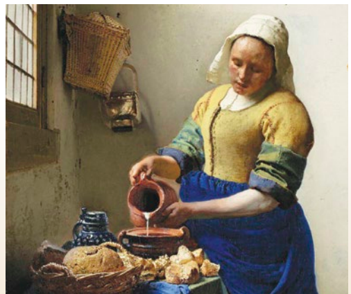
Right: The Milkmaid, Johannes Vermeer, Rijksmuseum, Amsterdam