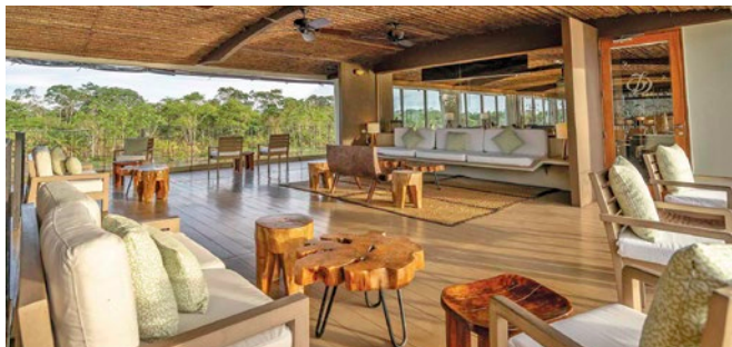
Delfin III covered deck

Please note: Program-specific terms and conditions are available at https://army.ahitravel.com/destinations/2000A?schoold=9 .