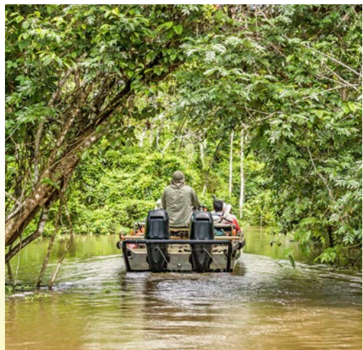
Exploring the Amazon aboard a skiff boat