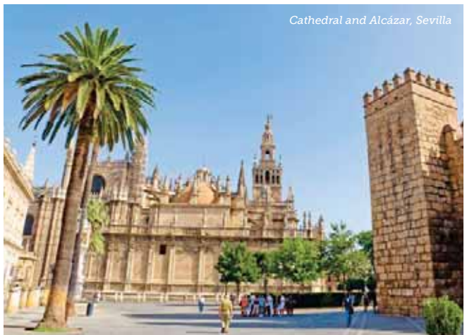
Cathedral and Alcázar, Sevilla