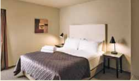
Carnmore Chateau Marlborough | Blenheim ●●●●●