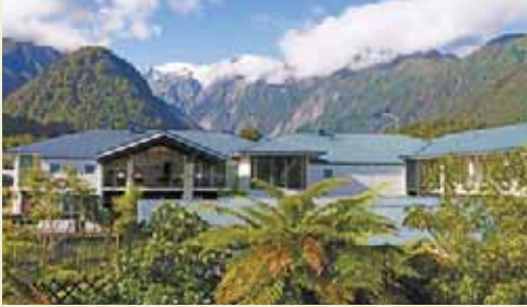
Scenic Hotel Franz Josef Glacier | Franz Josef