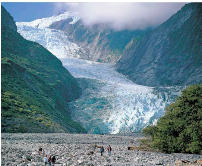
Franz Josef Glacier