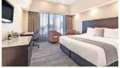
James Cook Hotel Grand Chancellor | Wellington ●●●●●