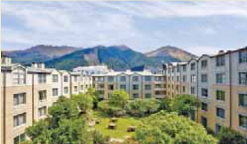
Millennium Hotel Queenstown | Queenstown