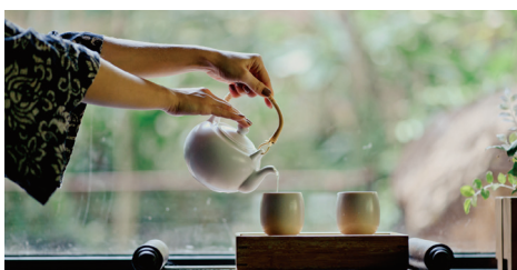
Top: Haedong Yonggungsa Temple | Above: Tea ceremony