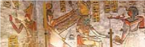
Hieroglyphics, Valley of the Kings