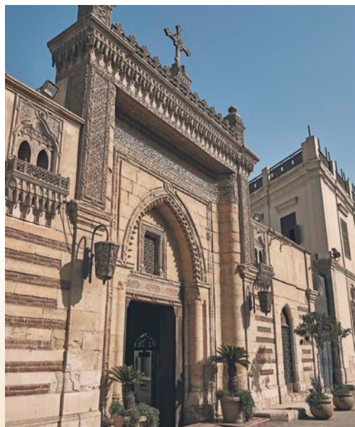
Hanging Church, Cairo

After breakfast, check out of the hotel.