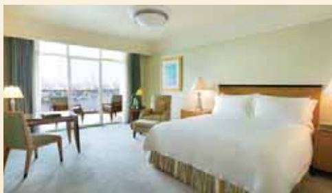
Four Seasons Hotel Cairo at Nile Plaza | Cairo