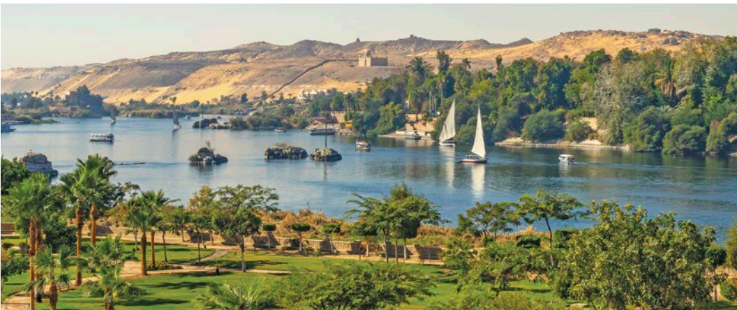
Feluccas sailing on the Nile River near Aswan

Abu Simbel. Visit the stunning Great Temple of Ramses II, which commemorates triumphs over the Nubians, Hittites and Syrians, and the temple dedicated to the goddess Hathor.