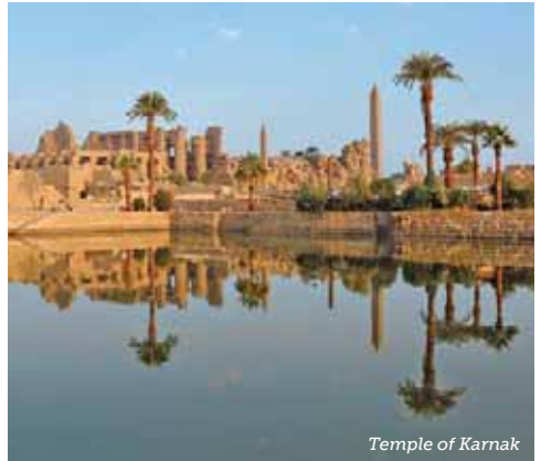
Temple of Karnak