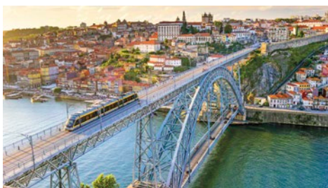
Top: Douro Valley | Above: Porto