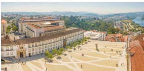
University of Coimbra

Activity Level: We have rated all of our excursions with activity levels to help you assess this program's physical expectations. Please call or visit our website for full details.