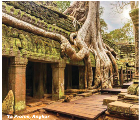
Ta Prohm, Angkor