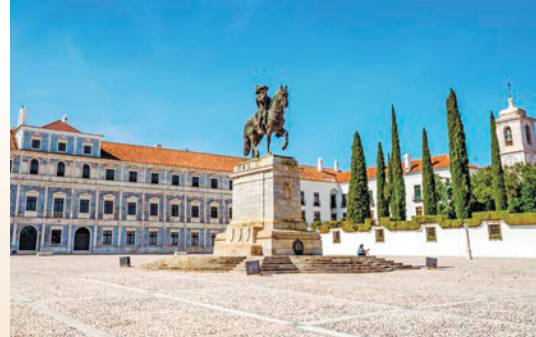
Ducal Palace, Vila Viçosa

Monsaraz. Take in the medieval atmosphere of this picturesque, hilltop village and sweeping countryside views during a guided stroll. Next, travel to Herdade do Esporão, a family-owned business on a large estate. Learn how their olive oil is made on a tour, take part in a unique