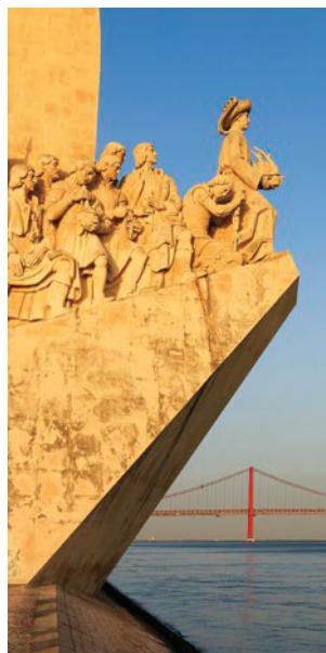
Monument to the Discoveries, Lisbon

Knowledgeable Lecturers deepen your appreciation for the region and its history, culture and current events.