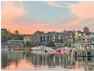
Macdonald Old England Hotel & Spa | Bowness-on-Windermere