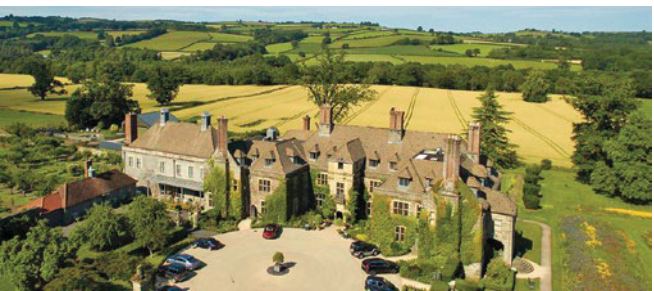
Llangoed Hall | Llyswen