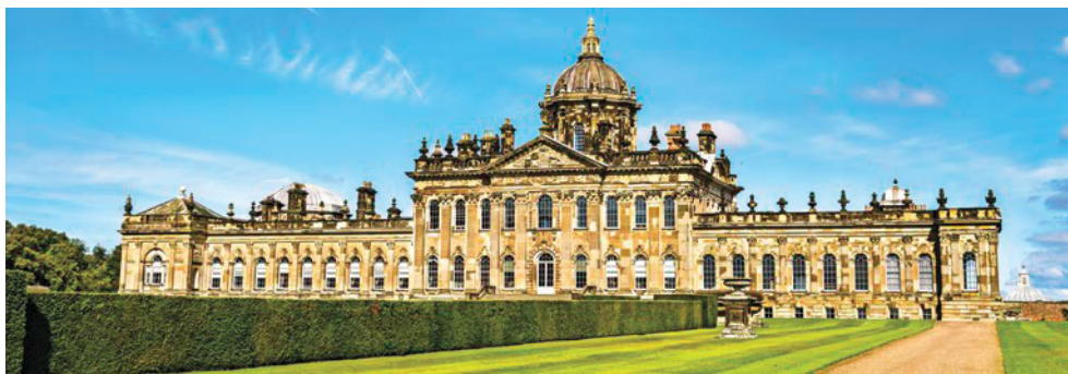
Iconic Castle Howard