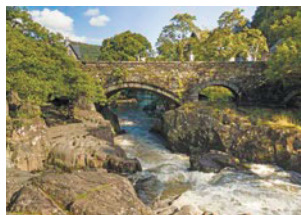
Betws y Coed