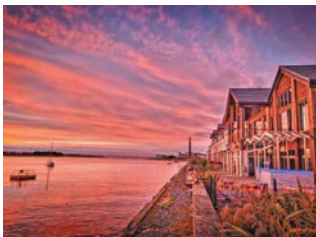
Quay Hotel & Spa | Deganwy