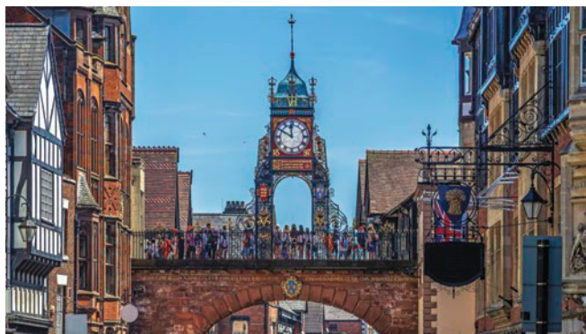
Eastgate clock on walls of Chester