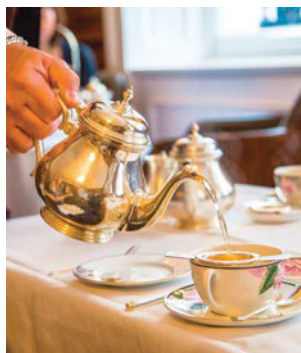
English afternoon tea

Knowledgeable Lecturers deepen your appreciation for the region and its history, culture and current events.