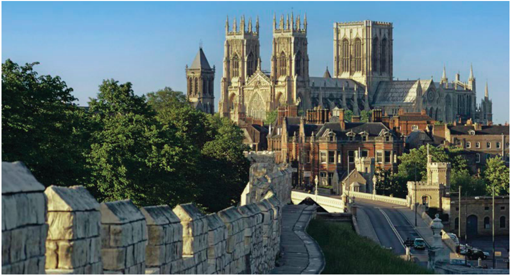
York Minster and medieval walls of York