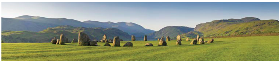
Castlerigg Stone Circle, Lake District