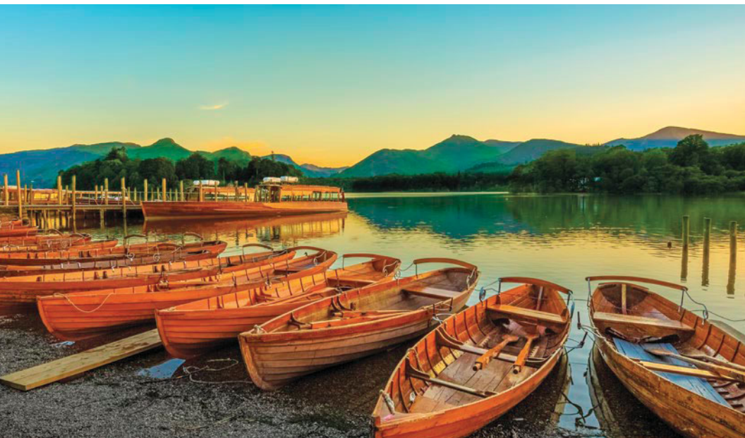
Serene Derwentwater, Lake District National Park

Later, savor lunch and a spirits tasting at a distillery followed by a pleasant cruise across Derwentwater from Keswick to Lodore Falls.