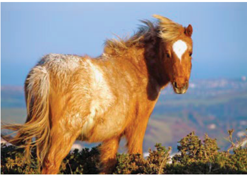
Welsh mountain pony, Snowdonia National Park

Traverse the heart of the United Kingdom on this enriching journey to northern England and Wales! Be nourished by the soul-stirring natural beauty of Britain's national parks and immerse yourself in the literary history of the romantic English Lake District. Marvel at majestic Welsh castles and atmospheric 12th-century ruins. Roam lovely Bodnant Garden and visit seaside Llandudno. Plus, engage in the cultural traditions of English tea and Welsh music!