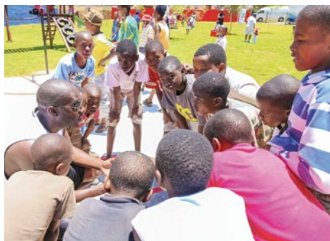
Youth of Soweto