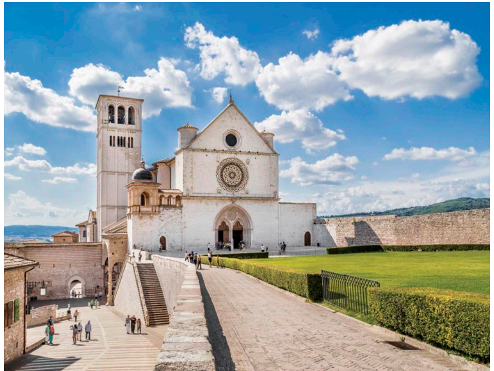
Basilica of San Francesco d'Assisi