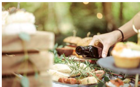
Top: Perugia | Above: Olive oil tasting