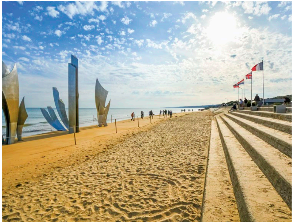
Les Braves Monument, Omaha Beach

Honfleur. Enjoy a full day at leisure in this picturesque town on the coast of Normandy immortalized in paintings by Claude Monet. Stroll through the stalls on market days, situated around the great wooden Church of St. Catherine and its belfry tower, wander its cobblestone streets, and see the timbered houses along the historic harbor.