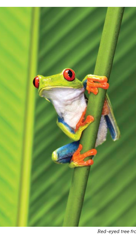
Red-eved tree from

The information in this flver is correct at the time of printing. Please visit our website to ensure that you receive the most current information