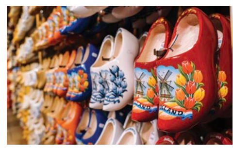
Top: Amsterdam | Above: Traditional wooden shoes