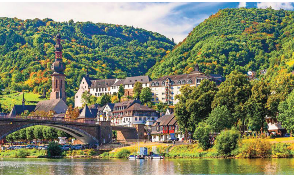
Cochem & Reichsburg Castle on the Moselle River

• A Musical Walk in Time. On a guided walk, see Rüdesheim's medieval walls and its main street, and then tour a delightful museum with self-playing musical instruments.