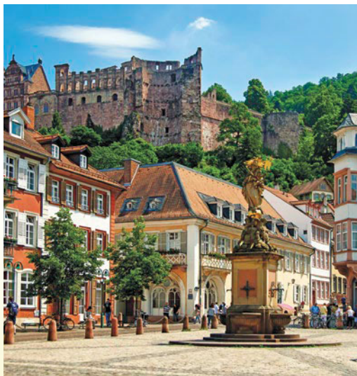
Heidelberg Castle above the historic old town