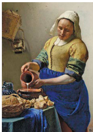
Detail of "The Milkmaid," Johannes Vermeer, Rijksmuseum