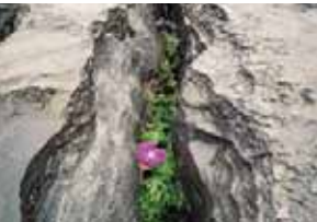
Flora among the limestone, Burren